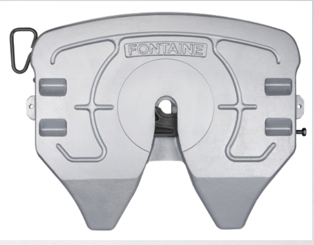
See page 2 for photo captions and images available for publication at www.fifthwheel.com/press

"Think of it as a fifth wheel with a brain," began Juan Hernandez, VP Sales & Marketing. "It utilizes advanced sensors to monitor the fifth wheel lock position every time you couple or de-couple from a